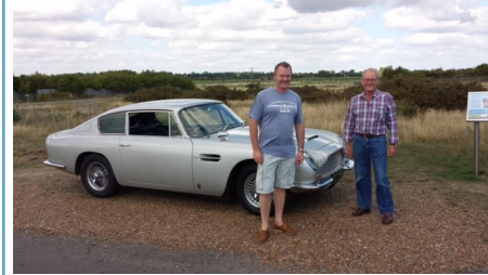
The Aston Martin DB6