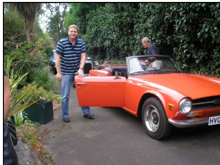
The Triumph TR6