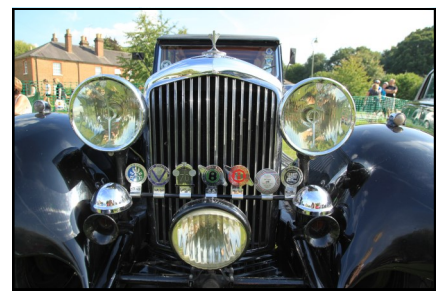
Above: 7 badge Bentley 1934, 3 1/2 litre