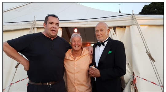
Who would mess with these boys?

Firstly a big thank you to all those who came along and supported Party By The Pond with entertainment by the amazing MADHEN! My heart sank on the Friday when the Gypsies moved into the Recreation ground but fortunately they were moved on quickly and the event went off smoothly with a fantastic atmosphere to bring our season to a close.