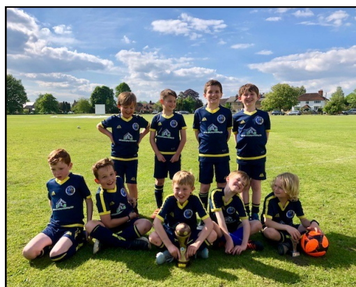
Youth 2 Football