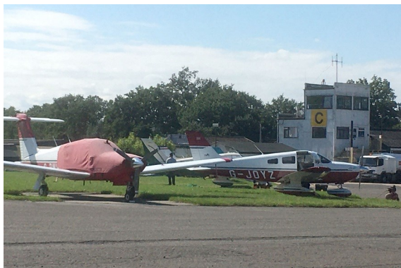
Fairoaks Airfield Chertsey

But now and being the innovative chaps that we are and far from wanting to rust away (referring to the cars and their owners!) small informal plans have been made for coffee meets (with obligatory bacon rolls) at local cafes where we can kick tyres, exchange stories, meet friends, and put a few miles on the clock. As can be seen in the accompanying photos we have visited the Old School Café near Chertsey and the Hanger Café at Fairoaks Airport. These outings are on alternative Tuesday mornings and are proving very successful so it is hoped to have a few more before the weather changes.