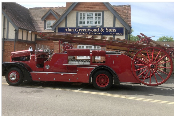
Alan Greenwood's 1948 Fire Engine

As mentioned in the last Village News we also now attend another local gathering monthly on the first Sunday at Alan Greenwood's premises in Chobham where we are in awe of his marvellous collection of beautifully restored classic fire engines all in full working order. Again this is a morning meet with breakfast refreshments supplied by the adjacent Italian restaurant or a visiting burger wagon.