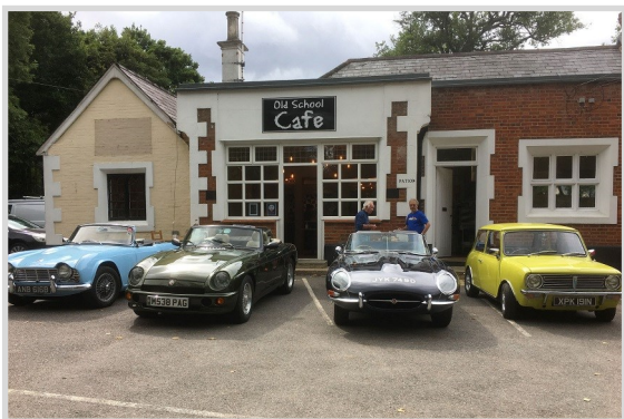
Old School Cars

In better times, during the good weather season, from perhaps from Easter to late September we would have had a full programme of classic car events to attend throughout the UK and extending into Europe with continental car tours. So many events there would be made it hard to choose which ones would be most enjoyable and thus attend. However in these strange times quite the reverse has occurred. With all social gatherings and motor sport events being cancelled we have had nowhere to go for outings in our beloved classic cars. After all we had spent the first three months of lockdown tinkering and preparing our cherished vehicles in preparation for drives in the beautiful countryside of our local counties.