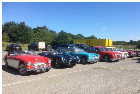
Line-up at Fairoaks Airfield