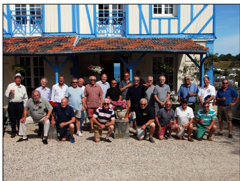
Above: WEMC members call into a fabulous fish restaurant overlooking the sea at Dieppe.