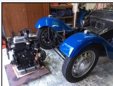
Rebuilt 1947 Morgan engine waiting to be fitted into the car.

It has been too bitter or too wet since Christmas for easy fettling of the treasured steeds but at least one rebuilt engine has been completed and is being shoe-horned into place, whilst the rest of us play with carburettors in the kitchen, or warm workshop, or turn our talents to more mundane and dangerous tasks such as being annoying to her indoors. However, anti-freeze has been checked, batteries charged, tyre pressures inspected and winter servicing in general completed.