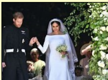
Prince Harry and Meghan Markle on their wedding day. The Duke and Duchess of Sussex

The next celebration was, of course, Prince Harry and Meghan Markle's Royal Wedding on 19th May at Windsor Castle. A special tea with entertainment which was enjoyed by all with some energetic members dancing and even jiving! Each member was presented with a commemorative teaspoon.