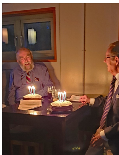
The Octogenarians!