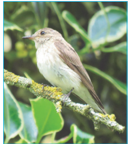
Above: A Spotted Flycatcher