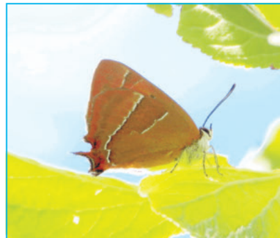
Left: A rare Brown Hairstreak butterfly seen in a local plum tree!