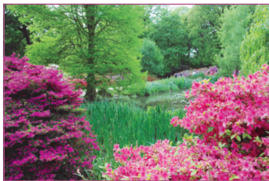
The Isabella Plantation, Richmond Park planted in 1831

A visit to the Isabella Plantation in Richmond Park was followed by lunch in Pembroke Lodge. A glorious day was spent sailing from Gosport on the "Two River Cruise" with lunch on board and a full five hours of sunshine.