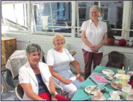
Tea at the Grange

This summer members paid a visit to the Grange in Bookham. The Grange is an organisation supporting people with disabilities to achieve their potential and live independent and fulfilling lives. It is a charity, a social enterprise and a housing association offering high-quality Supported Living and Residential Care services alongside a wide-ranging programme of Day Skills and work experience.