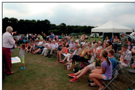
The Auction, exhibits and young winners of the day!