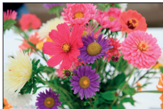
Another pretty Flower Show Exhibit

www.bhlandscapes.co.uk • Email: info@bhlandscapes.co.uk 64 Couchmore Avenue, Esher, Surrey KT10 9AU