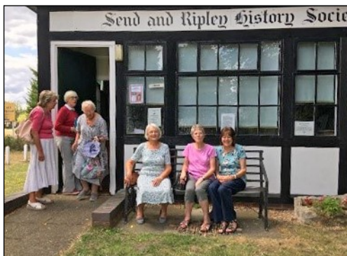
The museum at Ripley aka the old Nat West Bank building

We had a guided walk around Ripley in July led by a local voluntary member of the historical society. The walk commenced at the Ripley museum.