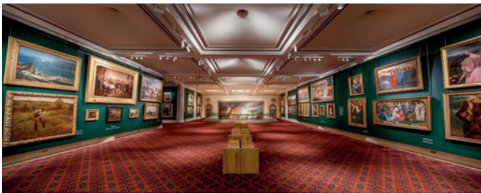
The Guildhall Art Gallery.