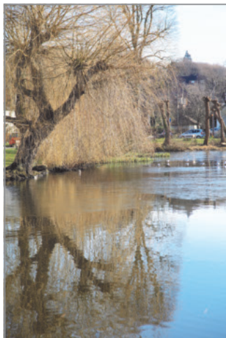
Willow Reflection - Prince of Wales Pond