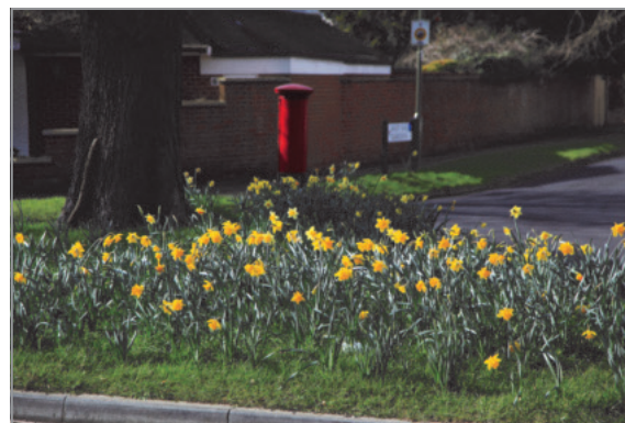
The third year of underplanting at junction of West End Lane and West End Gardens thanks to Roger Brooks.