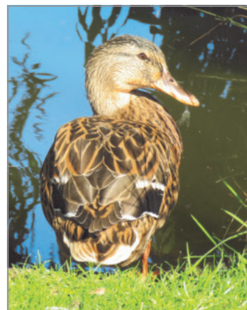
Female Mallard Duck