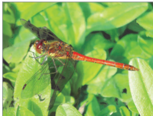
The Ruddy Darter Dragonfly by Prince of Wales Pond