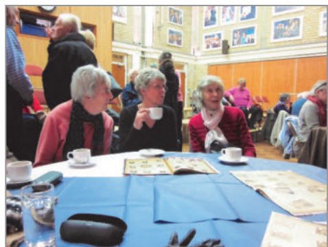
At the Dress rehearsal at Claremont Fan Court School.

On the 3 rd of February Claremont Fan Court School held a dress rehearsal for their production of 'The Sound of Music'. Six members went along and thoroughly enjoyed the very professional performance of all the pupils who took part.