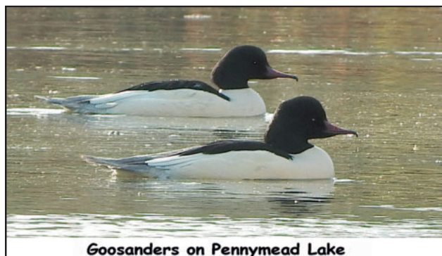
Goosanders on Pennymead Lake

Contact Lucinda (FE Tutor) on 07971 603876 about the 12 week course discount or pay £12 per session