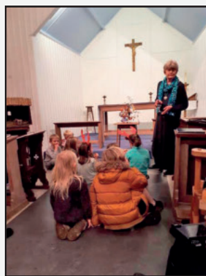
The children with the Jesse Tree

The Eucharist on Christmas morning was joyful – and for the second year running we were joined by two young trained sopranos, who sitting at the back of the church sprang into beautiful descants and harmonies during our Carols. It was a completely uplifting start to Christmas Day. If they are reading this – thank you both, from us all.