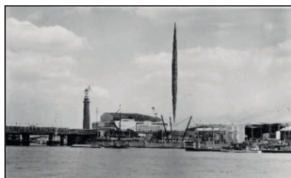
View from the Thames of the Skylon at the Festival of Britain 1951