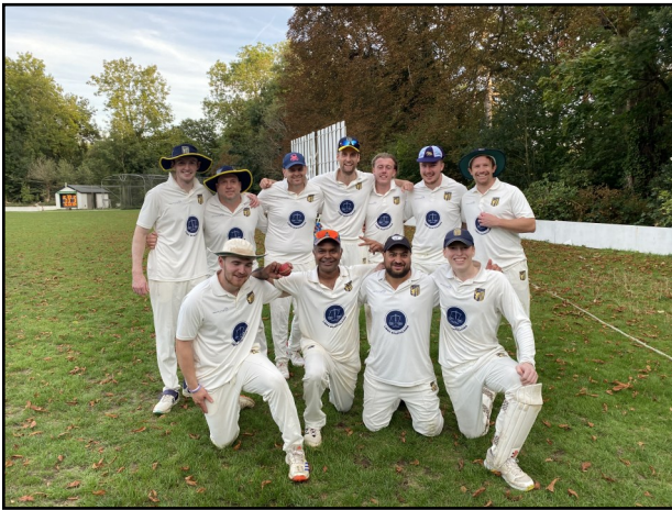
Our table topping team after a nail biting victory on the last day of the season to win the League.

The sun has finally appeared and the days are getting longer and warmer, so that can only mean that Cricket season is not far away! I'm absolutely delighted to let you know that having won the League last season, our First XI will be playing in the highest tier of competition they have ever achieved – a fitting end to our 150 th year. We will be playing some very big clubs this year, so plenty of challenge for the team – we would love to see you come and support them on the boundary this year.