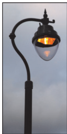
THE NEW VICTORIAN LAMPPOST

Having only recently replaced all of the village's old Victorian lamp posts, with modern energy saving lamps, it was a pleasant surprise to find that Surrey County Council had mysteriously removed some of these and installed ten beautiful new Victorian style lamps at strategic points around the village! These are much more in keeping with the village surroundings!