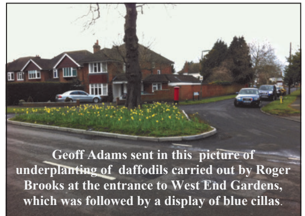
Geoff Adams sent in this picture of underplanting of daffodils carried out by Roger Brooks at the entrance to West End Gardens, which was followed by a display of blue cillas.