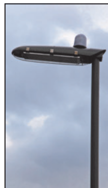
THE NEW MODERN ENERGY SAVING LAMP POST