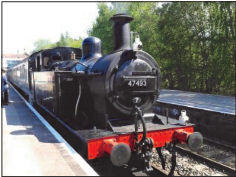
The Spa Valley steam train travels between Tunbridge Wells West, Eridge via High Rocks and Groombridge.