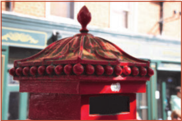
The ‘Penfold’ Postbox—there are only 12 left in the UK.