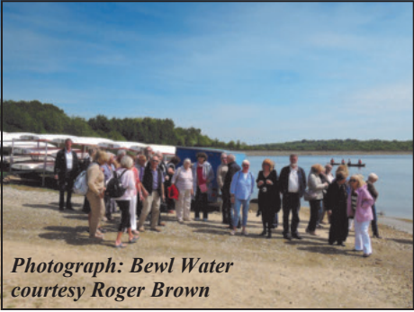
Bewl Water

On 26 May fifty villagers enjoyed a champagne and strawberry breakfast in the Sports and Social Club before departing with Hills of Hersham for Bewl Water. Bewl Water Reservoir is the largest stretch of open water in the South East and an important source of drinking water. It can hold more than 31,000 million litres of water, enough to provide water for up to nearly 200 million