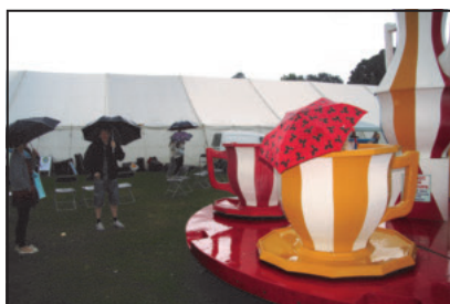
Above: Last year's show was 'rained off' but not everyone was put off—many took refuge in the marquee and the little girl here is sheltering in a Teacup!