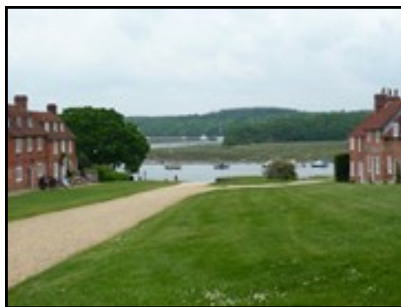
Above left: Waiting for the boat at Buckler's Hard and (right) cottages and Riverside