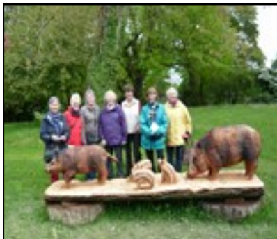
Chainsaw carving from a fallen tree. Ramster Garden

Towards the end of May there was an outing to Buckler's Hard in the New Forest and we learned about some of the social history and the boat building undertaken here in the 18 th century. Some people took a boat trip on the river and discovered that Sir Francis Chichester began his historic round the world voyage from here and the Beaulieu River was one of the assembly points for boats taking part in the D-Day landings.