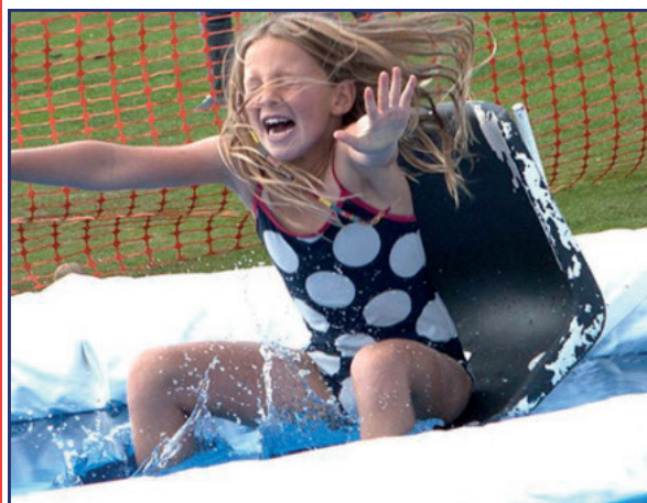
Photographs taken at the 2014 show