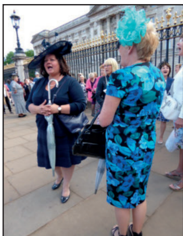
Singing 'Jerusalem' after the Garden Party.