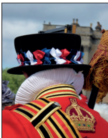
Yeoman of the Guards' royal regalia

The Court Circular stated, "The Duchess of Cornwall held an Afternoon Party in the gardens of Buckingham Palace..." The Countess of Wessex was also expected to join the party. In addition Princess Alexandra, and the Duchess of Gloucester appeared, much to our delight. Places were limited to two per institute, chosen by ballot. Due to a National F.W.I. spread sheet error, 500 additional members were invited by mistake. As a result the long term President of West End (Esher) W.I. had her invitation withdrawn. This was very upsetting, without her West End (Esher) W.I. would no longer exist. Our protests were acknowledged but no action was taken.