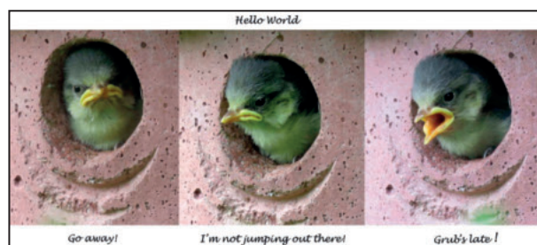
Blue Tits just emerging from a local nest box.

The Club meets every Tuesday at West End Village Hall at 1.45-4.45pm during summertime. Chicago is played on the first Tuesday of the month. Why not come along? The atmosphere is relaxed and (if necessary) a bridge partner will be found for you.