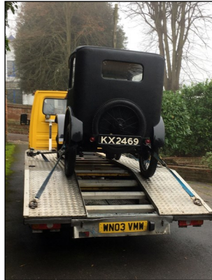
Above: Fabric on her way

Apart from the clutch there were quite a lot of other jobs that really needed to be done, such as king pins and rear springs, and after a lot of thought I decided against do-it-yourself and packed the little saloon off to a nice man in Kent who specialises in making Austin 7s feel and go better. At the time of writing (mid February) most of the work is reported to be done and I am hoping to see it back in West End quite soon - give me a wave.