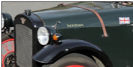
Above: Lockdown Special

Roger's little car has had a quiet winter under Lockdown 3, just a few runs around his local block trying out various adjustments and is now beginning to go like he had hoped it would from the beginning. There is one job remaining for when it is possible to visit the West End Club once more and that is to hold a ceremony when 'little car' will be formally named 'lockdown' - and duly anointed.